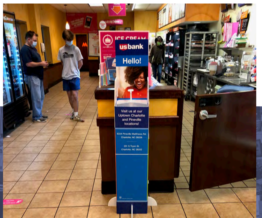
ICE CREAM SHOPS / COFFEE SHOPS

Contact your sales representative today to get more information on custom-built alternative programs.