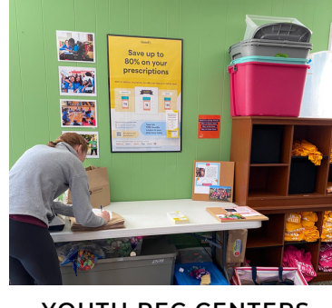
YOUTH REC CENTERS